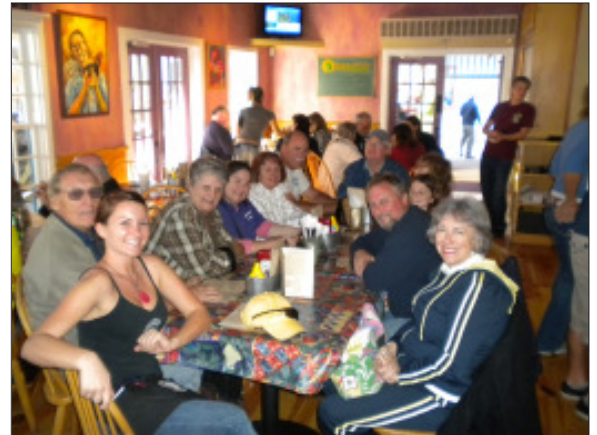
Cruisers relaxing over lunch at the Florida Cracker Cafe